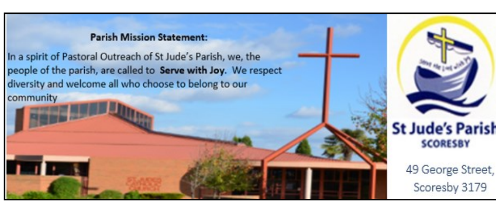
33rd SUNDAY ORDINARY TIME—YEAR A 19th November 2023